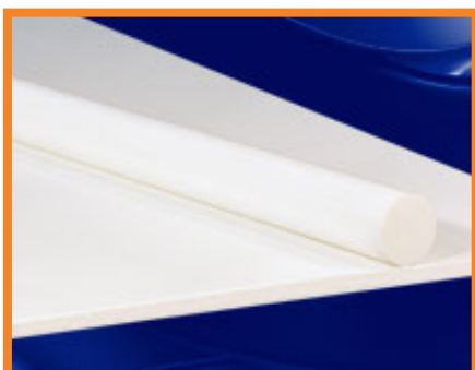
Ertalyte® PET-P Natural